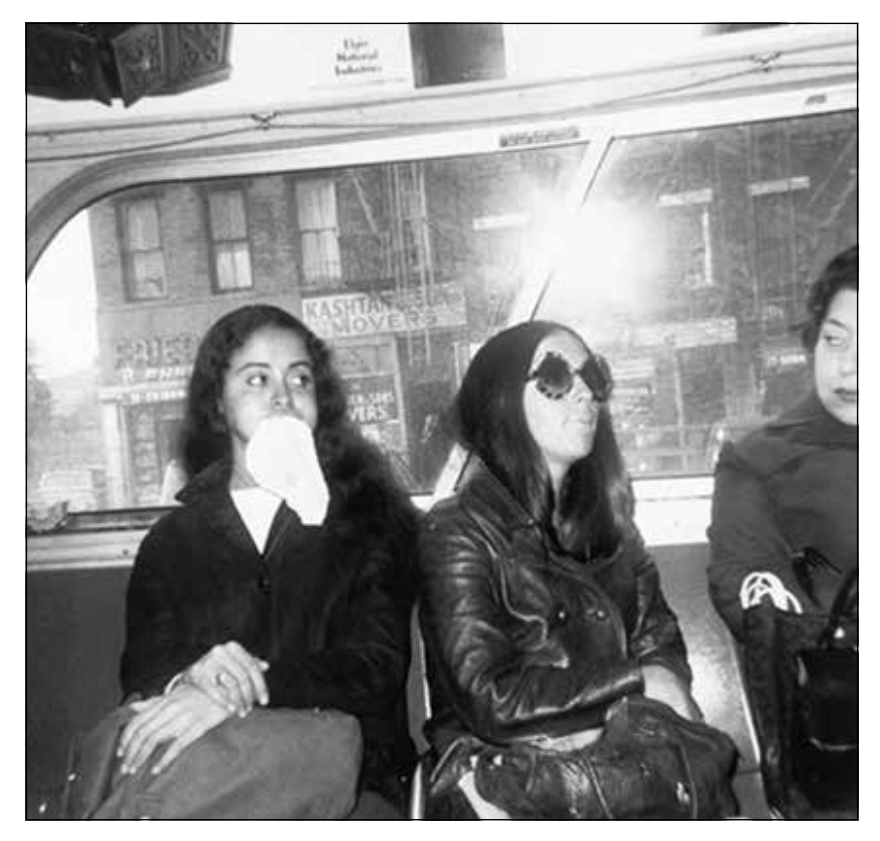
Figure 12.6. Adrian Piper's Catalysis IV (1970), riding a crosstown bus with a towel in her mouth. Performance documentation: 5 silver gelatin print photographs, 16" x 16" (40.6 cm x 40.6 cm). Collection of the Generali Foundation, Vienna. Copyright by Adrian Piper Research Archive Foundation Berlin and Generali Foundation.

art was but a "catalytic agent between myself and the viewer" that creates an "ambiguous situation":