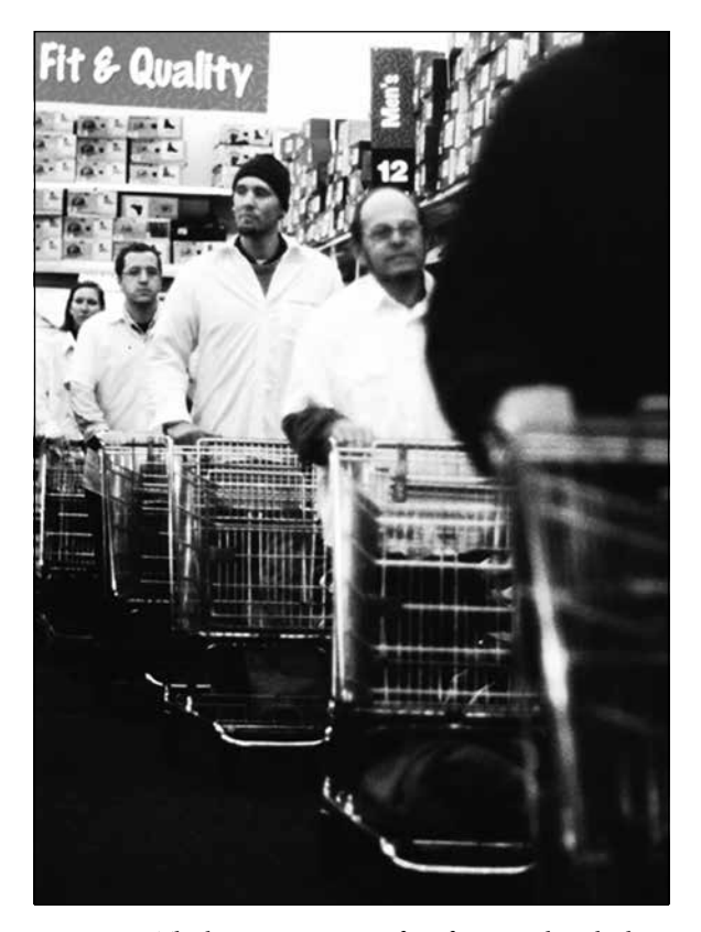
Figure 12.3. The becoming-event of performing the whirl.

exit the store. As ruptural performance, the whirl does not make any specific claim on protesting the many things one could agitate against—sweatshop labor, poor treatment of store employees, predatory business practices, etc.—given that most people present could recite this litany of wrongs. Rather, the whirl enacts the becoming-event of "not shopping," which in itself can be read as an engagement against over-consumption, Wal-Mart's imperialism, unfair labor practices, or ecological devastation.