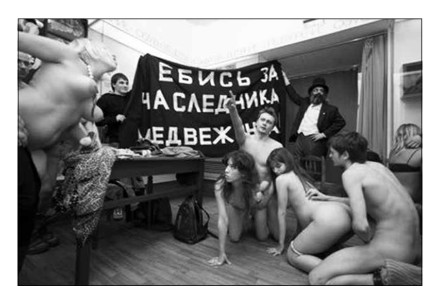
Figure 12.4. Voina's "collective fuck action," "Fuck for the Bear Cub" (2008) in the Moscow Biological Museum.

Similarly, in Voina's "Humiliation of Cop in his Own House" (2008) action days before Medvedev's inauguration, the group entered a Russian police station, pasted photos of Medvedev throughout the building, formed a human pyramid to recite a poem by Soviet dissident D. A. Prigov, and attempted to serve the officers tea and cake. In this work it is the confrontational act of performing what they call "innovative art-language" within the state-controlled space of the police station that constitutes "vivid political protest art" (Dolcy 2010, n.p.)