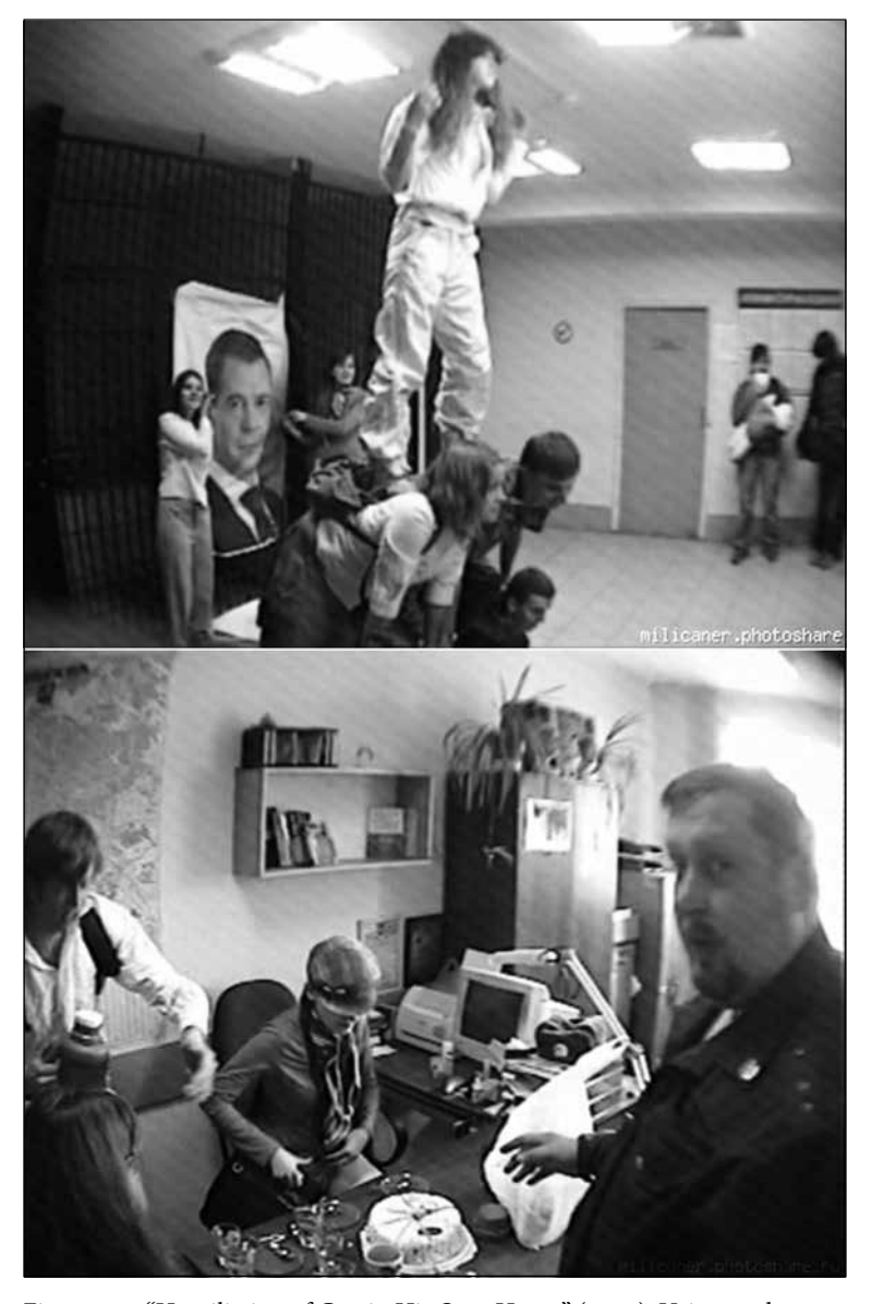
Figure 12.5. "Humiliation of Cop in His Own House" (2008): Voina reads poetry from a human pyramid of dissident poetry and serves tea and cake to police.